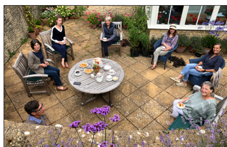
The Way We Were: Garden Coffee Breaks last summer. Watch out for their return in April