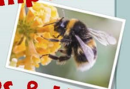
Bees & Honey