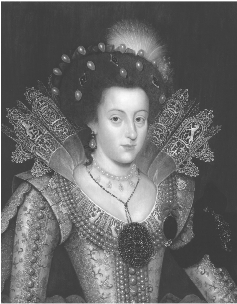
Elizabeth of Bohemia

This month there is a Royal Wedding between HRH Prince Henry and Ms Rachel Meghan Markle. When discussing the Prince's possible choice, it was accepted, as it was with HRH Prince William, that he would doubtless marry a 'subject' rather than a Royal Princess from another land. The Queen's Father married Elizabeth Angela Marguerite Bowes Lyon (The Queen Mum) and similarly many Kings before him married commoners, and even more Scottish Kings did.