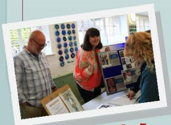
Info & history

Also learn more about what's going on in your village, and MUCH more. In and around the village hall