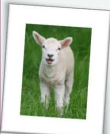
Lambs & Ponies