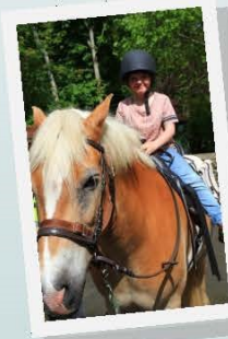
Pride of Avening Awards