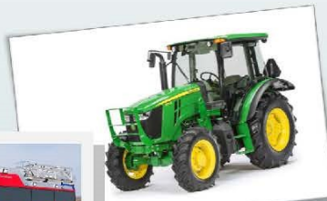
Tractor and Fire engine