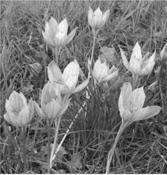
colchicum autumnale (autumn crocus)

I am beginning to clear the vegetable plot, save for a few rows of cavolo nero (just coming back into leaf production after a destructive onslaught by cabbage white caterpillars), spinach beet and leeks. Now is the time to shovel on that well-rotted home-made compost, the food for the soil. In the past the accepted wisdom advocated 'double-digging', the creation of trenches in which to bury the manure or compost. Latterly, the concept of no-dig and been espoused and promoted, by such people as Charles Dowding from Shepton Mallet. In brief: you shovel the compost on top and allow the worms and other soil-dwelling