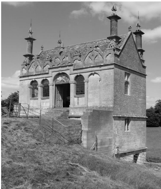
East banqueting house, Campden House