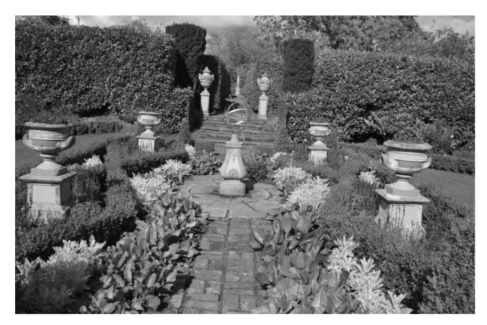
The Jubilee Gardens

birthday. A party of Avening Gardeners and Friends booked a visit to see it for themselves on a golden, late September afternoon. We were enchanted by all we saw: the views outward the Herefordshire countryside, the vistas terminated by a monument, the subtle balance of formality and informality, the memorials to cats gone by and the real cats - and lastly, but not least, by Sir Roy