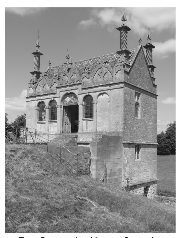
East Banqueting House, Campden House

If you follow the Cotswold Way, from its start in Chipping Camden, along to Broadway Tower, down into Broadway, along to Stanton and on, you come to The beautiful Stanway. Jacobean Stanway House, with an early 18th century water garden, possibly laid out by Charles Bridgeman, is open to the Tuesday and Thursday public on afternoons. Not to be missed is the 300 foot gravity fountain, installed in 2004 simply stunning.