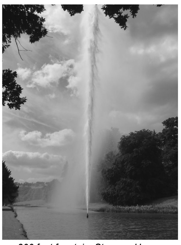
300 foot fountain, Stanway House

(Note to eds. I make no apology for including so many garden visits in this column. There is just so much to see within striking distance of Avening!)