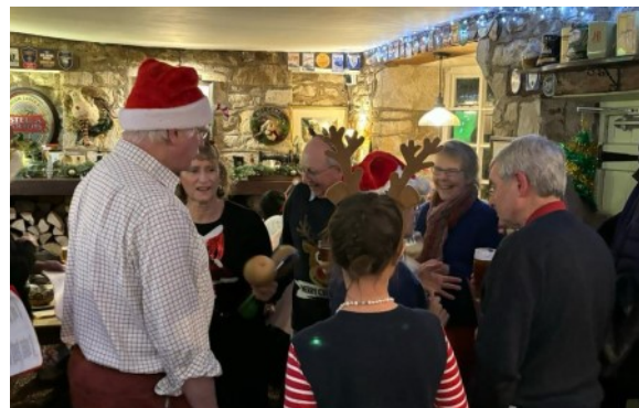
Top: Avening Silver Band at the Christmas Fair. Middle: Avening Singers prepare to sing at the Christmas Carol Service. Bottom: Carol Singing at the Bell