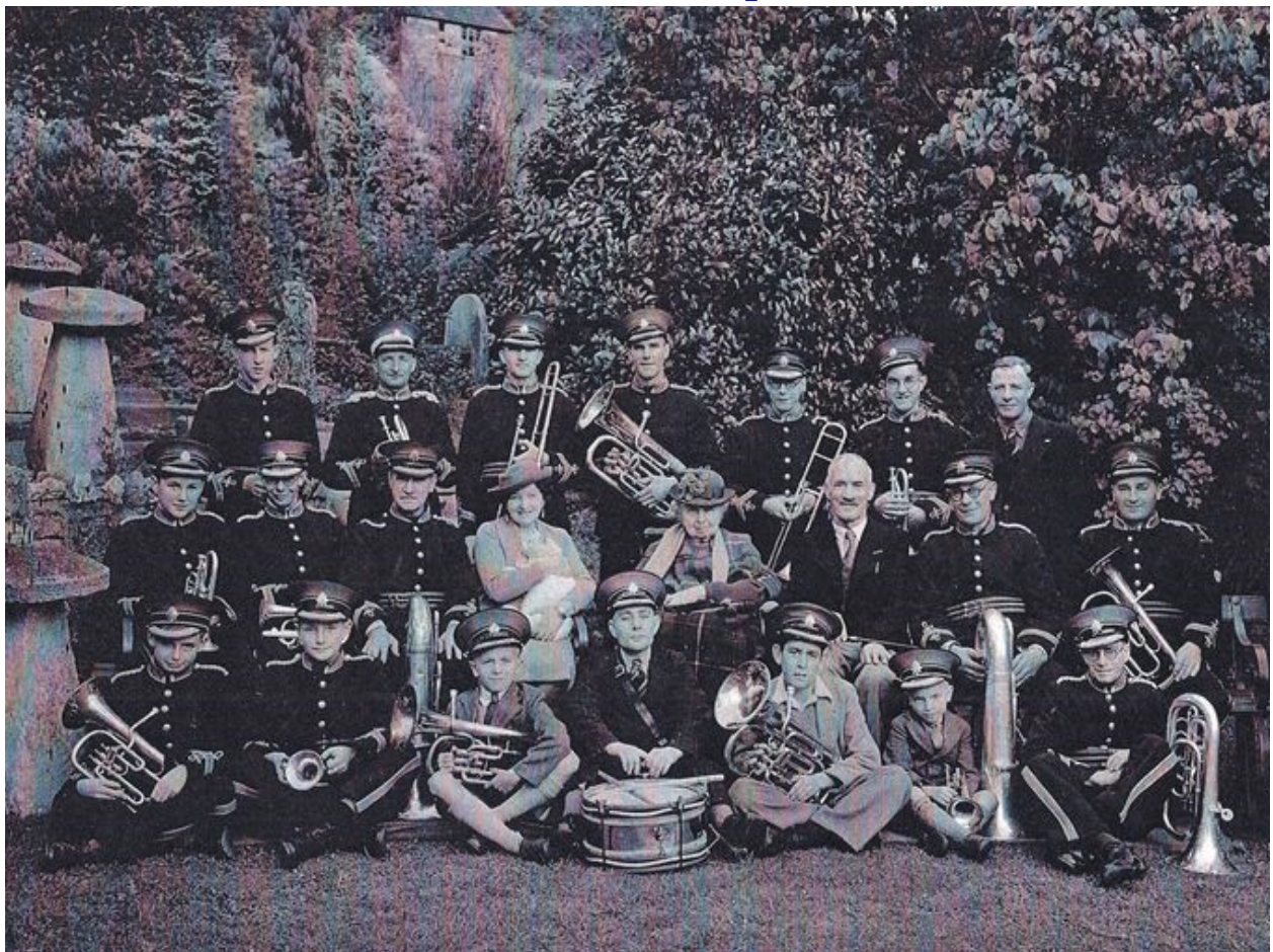
Avening Band 1947