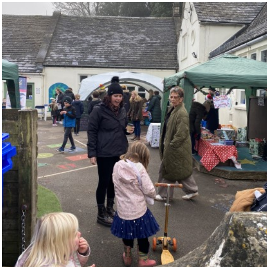
Fun and games at the FOAS and Playgroup Christmas Fair