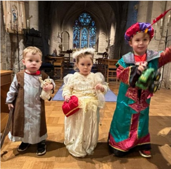
A shepherd, and angel and a king arrive for Avening Nativity