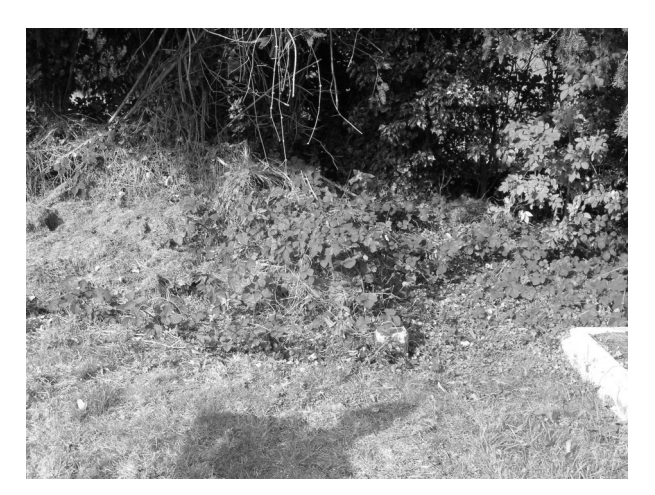
Before & After: This grave is on the right of the footpath up to the top right hand gate.