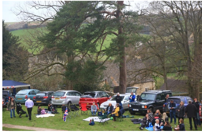
Running up to watch the fire-lighting though some of us preferred to stay below and eat cake, listening to the two Jims