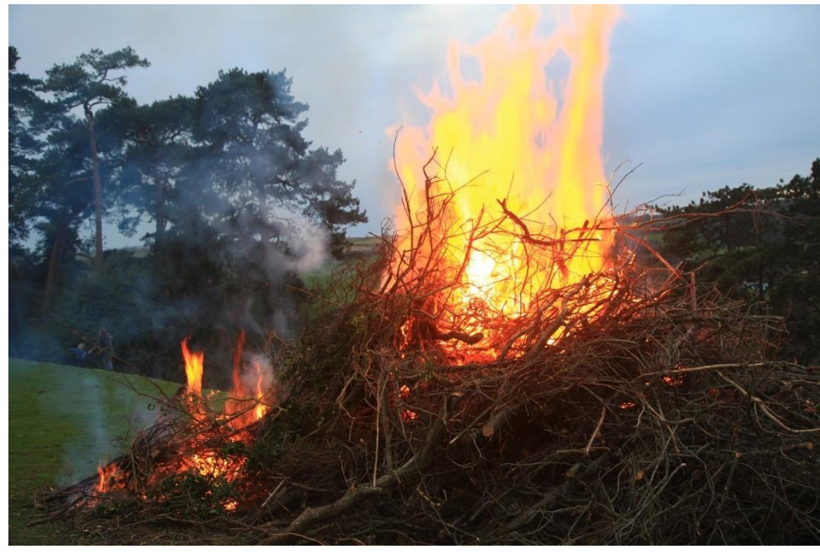
Got there in the end!