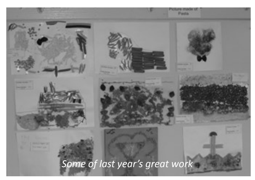
16<sup>th</sup> July 2016: 2pm – 4pm Cherington Village Hall

Children love making things and also have a wonderful sense of achievement when they see what they have made. Cherington Show has for over 70 years had a section in its flower, vegetable , and craft show for children's work — in fact over 20 competitions are for children only. We love seeing how creative they are and each year we try and change the competitions to make them more interesting .