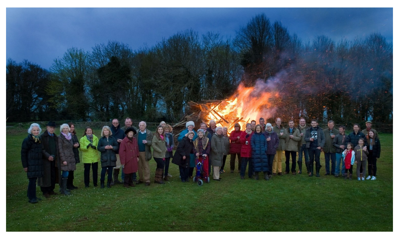
Cherington's beacon got going well.....