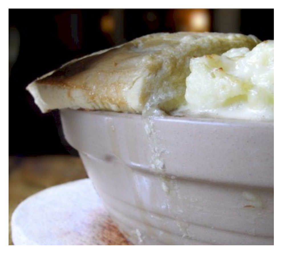
UNDER NEW OWNERSHIP BUT STILL THE HOME OF THE 2in1 PIES