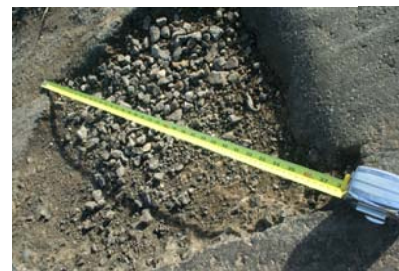
Another pothole in Chavenage Lane

We can't be too optimistic that the patchwork of surfaces will greatly improve