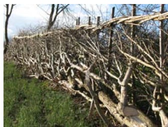
One side of the playing field is complete